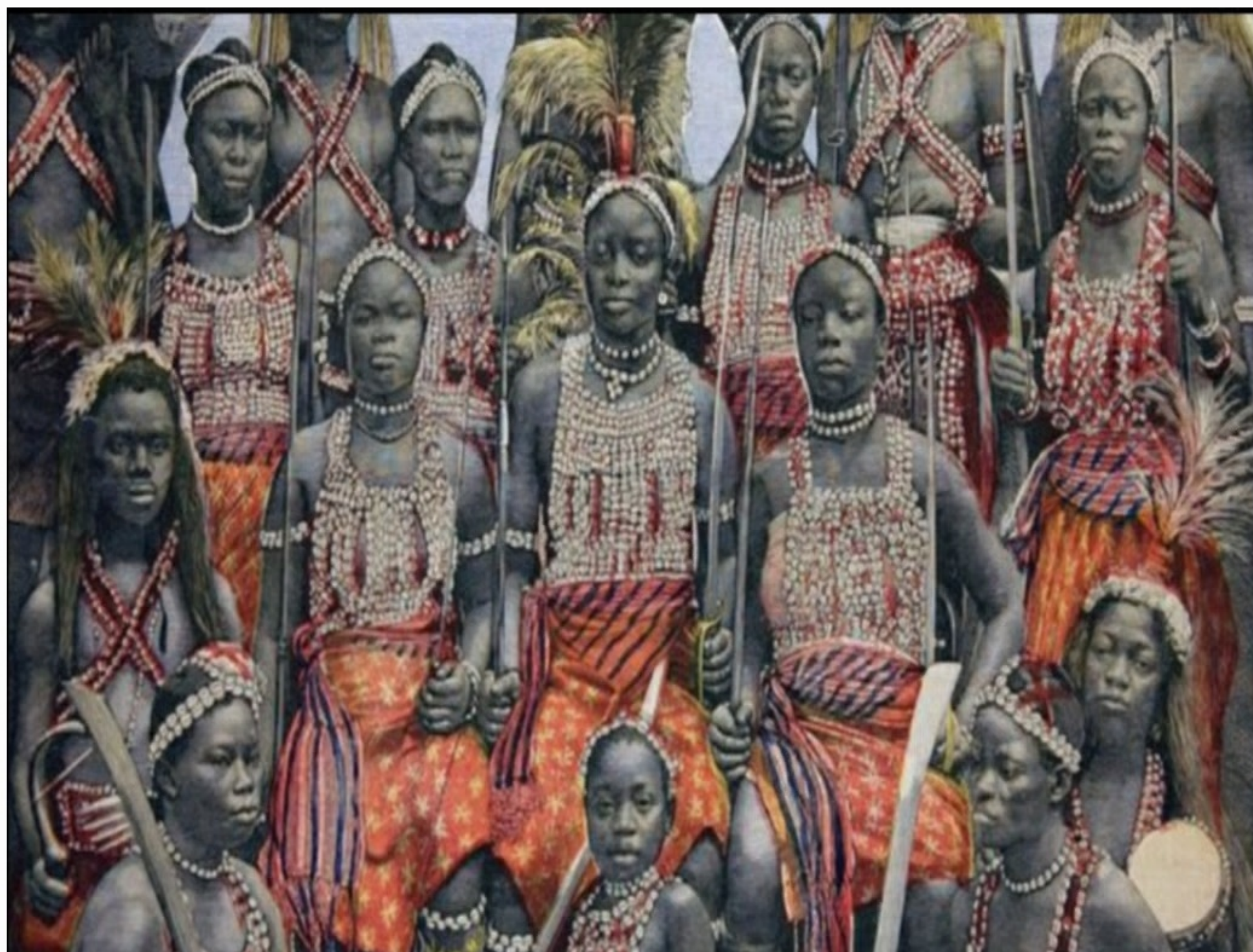
Depiction of the Dahomey Amazons - The Agojie